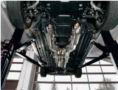
SPL 10000 telescopic and asymmetric carrying arms

The SPL 10000 is a hydraulic asymmetric two post lift with a lifting capacity of 10,000 pounds. The lift features a powerful 3.5hp integrated power unit and covered hard-chromed cylinders, making it a precisely engineered mix between durability and appearance. The SPL is the perfect lift for your shop.