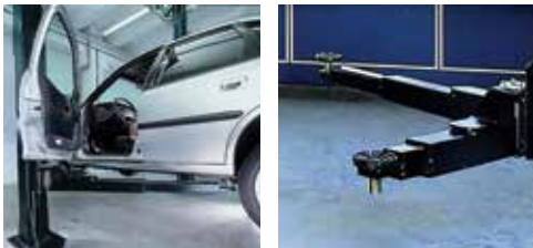
Asymmetric lifting allows easy access for interior work