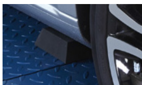
Rubber pyramid block