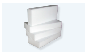
Polymer pads 50x150x340 mm