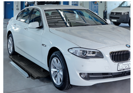
Very flat design: Ideal for lowered vehicles