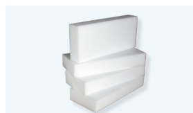
Polymer pads 50x150x340 mm (included)