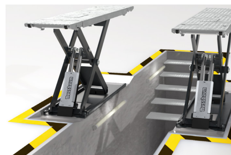
Can be installed above a work pit or at floor level for optimum working comfort