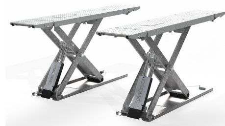
Fire galvanization of scissors and base plate for corrosive environment